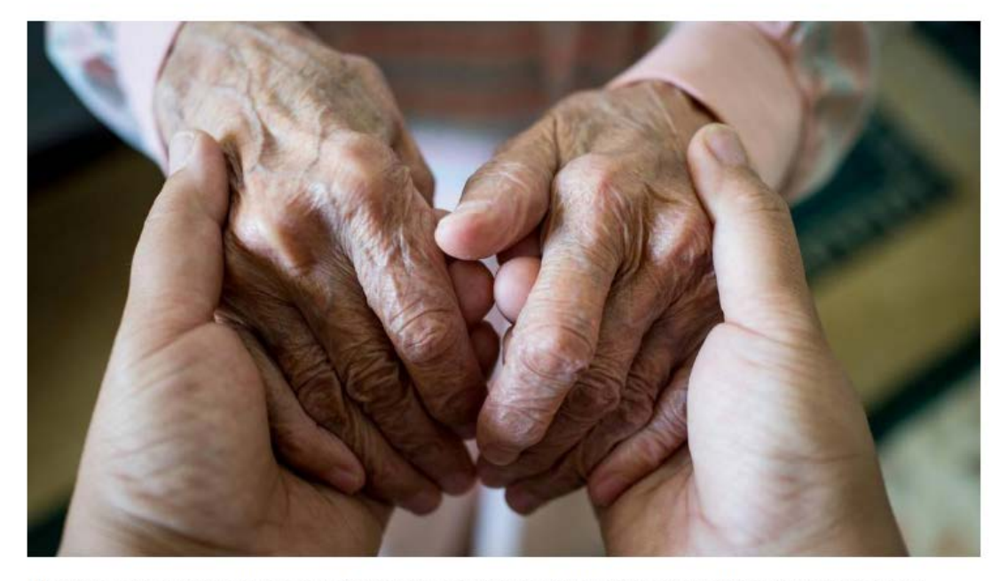
Home care and community-based care for elderly residents allow them to age in place and save taxpayers' money.

For decades, national surveys have shown that older adults prefer to age in place, in familiar surroundings. These surveys underscore the fact that, "There's just no place like home." This is not just a tagline for United HomeCare, it's an integral part of our corporate DNA and mission.